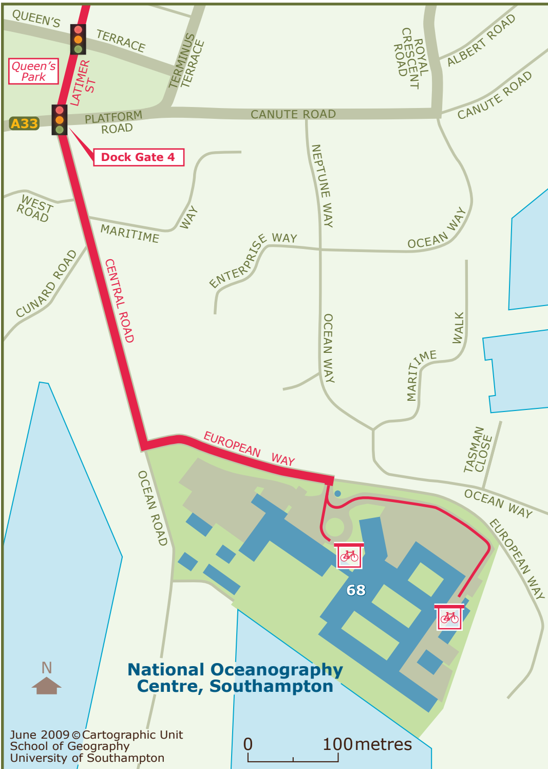
MAP 1 National Oceanography Centre, Southampton